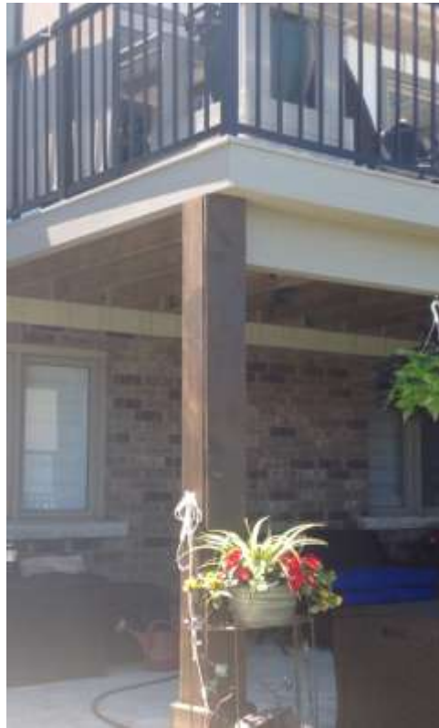
After cladding the support posts with pressure treated wood and stain. (English Walnut WST22-9)