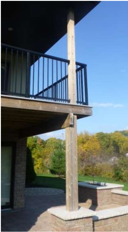
Before cladding the support posts