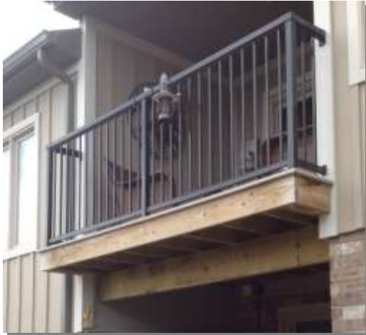
Before cladding with composite fascia

But keep in mind, this option will require future maintenance in order to meet the required standards of the community.