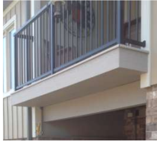
After cladding with composite fascia (Azek: Slate Grey)

If the balcony has upper and lower support posts, the owner can clad the posts with one of the two options: